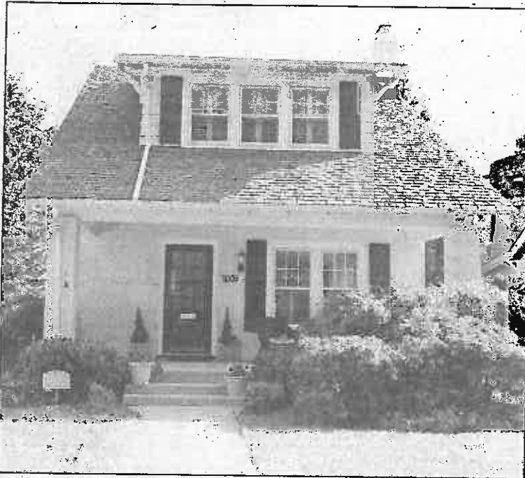
The home at 7005 Georgia St. in Chevy Chase, Md., has a white brick exterior and a large front porch with columns. It is on the market for $845,000.

The home, which is conveniently located between Connecticut Avenue and Brookdale Road, also enjoys a quiet tree-lined street location in Chevy