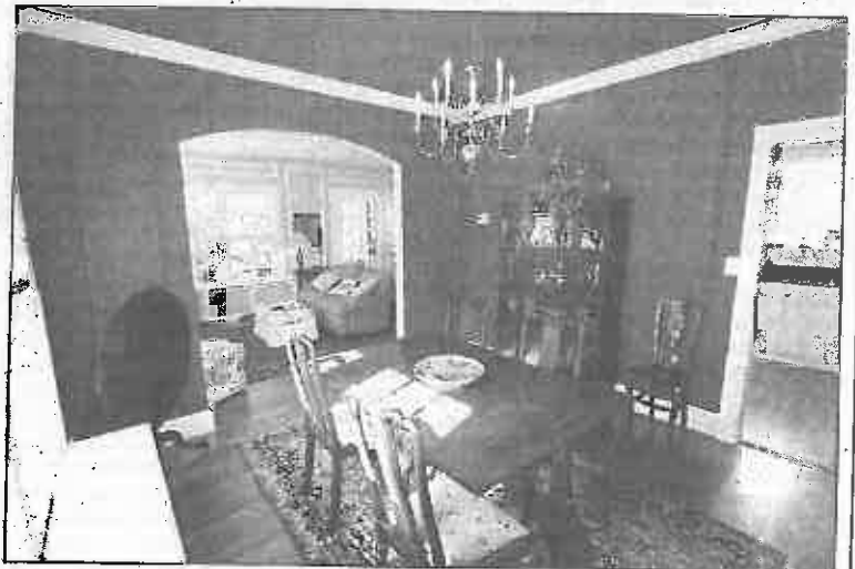
A wide, arched entryway leads from the living room to the dining room, which also features easy access to the kitchen and the home's sunroom.